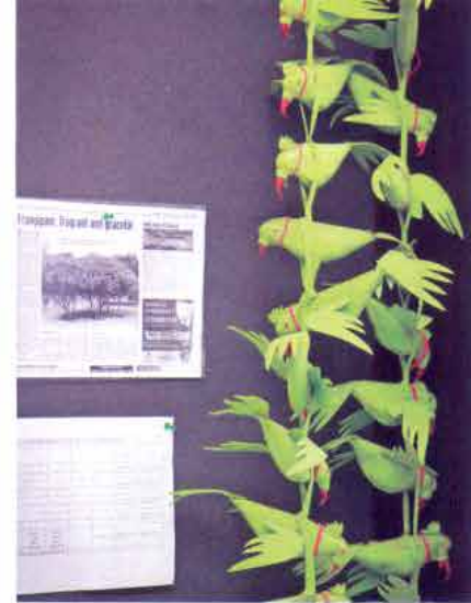
From Left Sonali's long wooden desk piling with paraphernalia; Felt parrot figurines lends a tropical touch to the ambience Below A jagged, scaled-down prototype of a built form