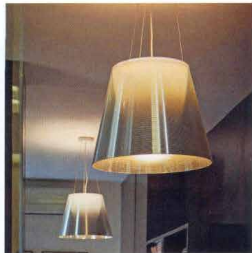
KTribe S3 Suspension Lights from Flos are hung in the passageway